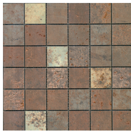
2 x 2 full sheet mosaic

Note: Individual sheets may not show the full range of color and graphics.